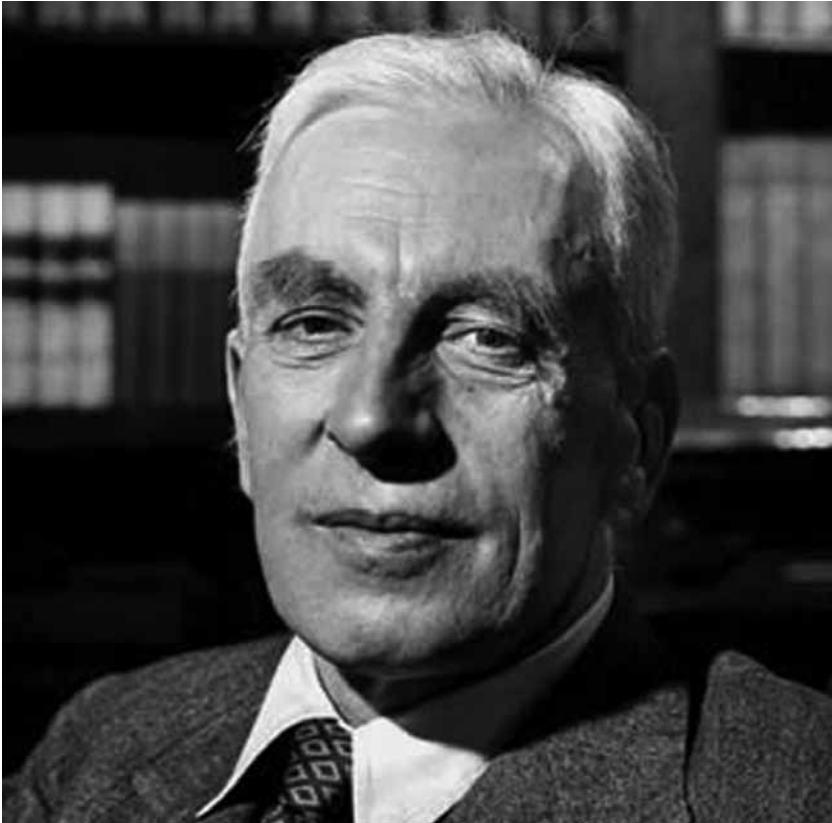
▲ Arnold J. Toynbee (1889-1975), one of the most influential twentieth-century philosophers of history.